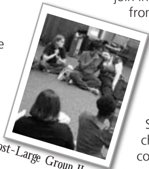
Post-Large Group Hangout